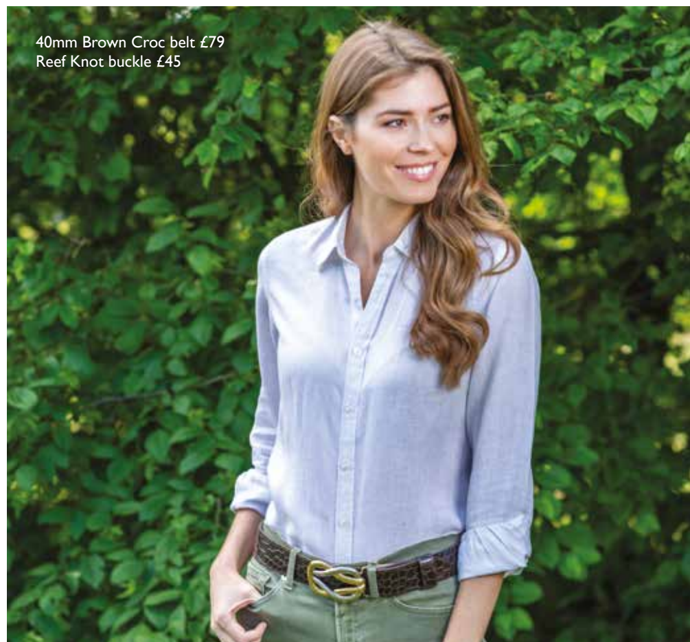
40mm Brown Croc belt £79 Reef Knot buckle £45