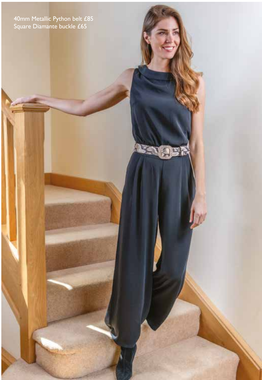
40mm Metallic Python belt £85 Square Diamante buckle £65