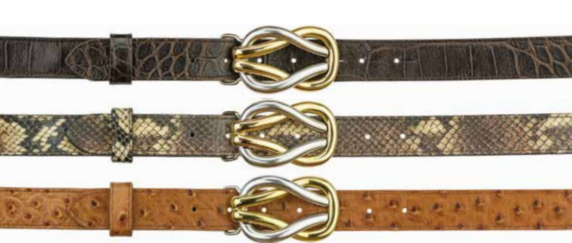
30mm Reef Knot buckle £40 on Brown Croc, Python and Tan Ostrich £75