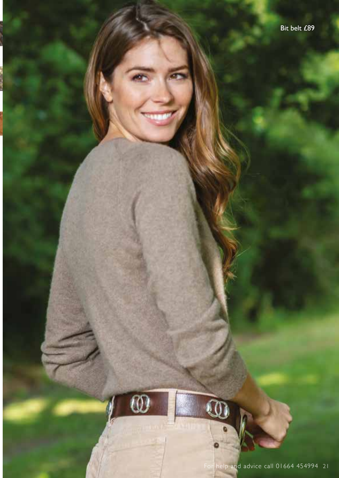
Bit belt £89