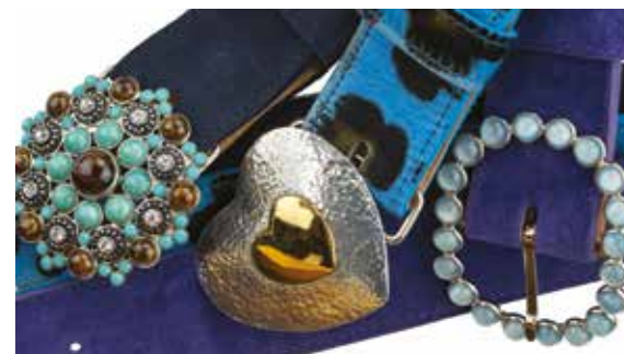
Navy Suede belt £75 with Festival buckle £125, Blue Leopard belt £79 with Two Tone Heart buckle £40, Purple Suede belt £75 with Blue Stone Oval £75