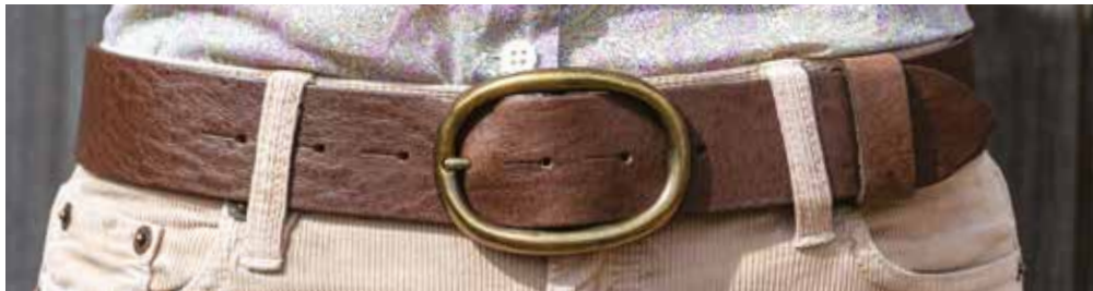
Brown belt and Gold classic buckle £55

Sizes small (29 – 35 inches), Medium (33 – 39) Large (37 – 43) in black and brown.