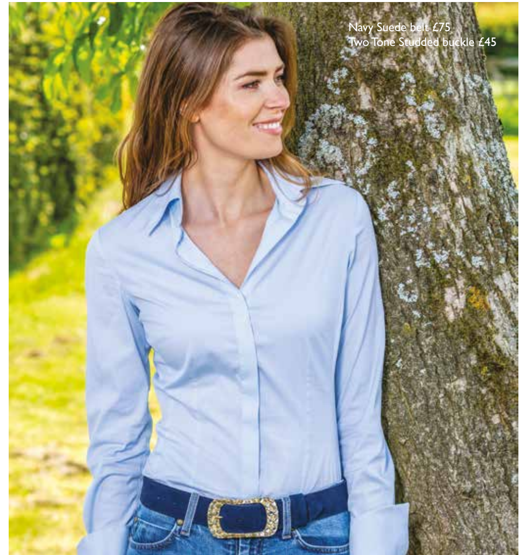
Navy Suede belt £75 Two Tone Studded buckle £45