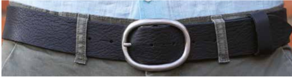
Black belt and Silver classic buckle £55

These jeans belts are a great present or introduction to the Peachy range. Made from quality, unlined Italian leather; they have the same detachable buckle system as the rest of the range and come with the classic oval buckle seen here in brushed silver or gold.