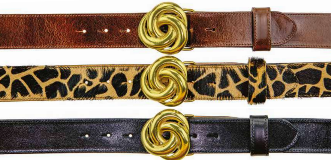
Gold Russian Knot buckle £45 shown on Black Leather, Giraffe and Brown Leather all £79