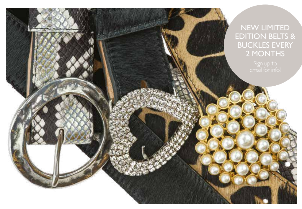
Metallic Python belt £85 with Silver Hoop buckle £35, Black Cowhide belt £79 with Diamanté Heart buckle £85, Giraffe belt £79 with Pearl Waterlily buckle £85