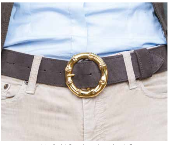
with Gold Bamboo buckle £45