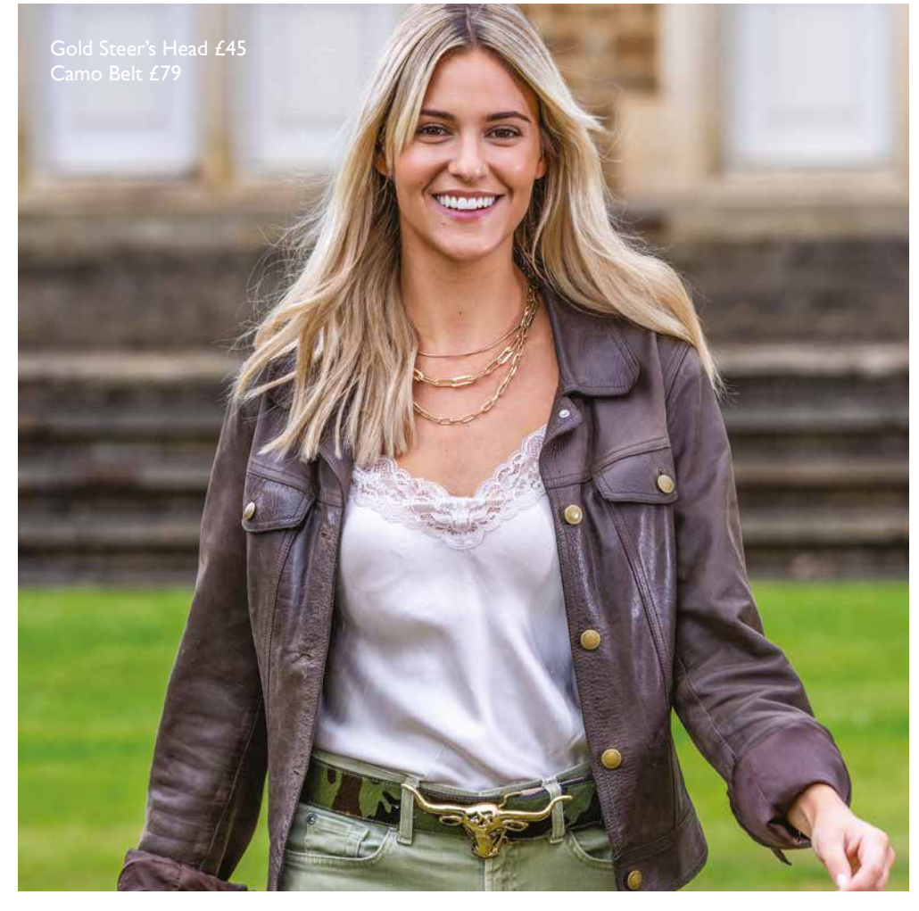
A variety of brown tones