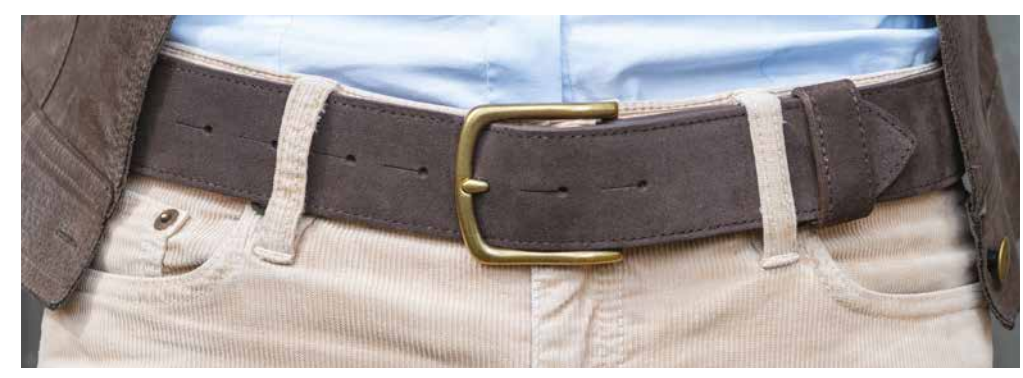
All belts come with a plain gold or silver buckle – brown suede belt \pounds 75