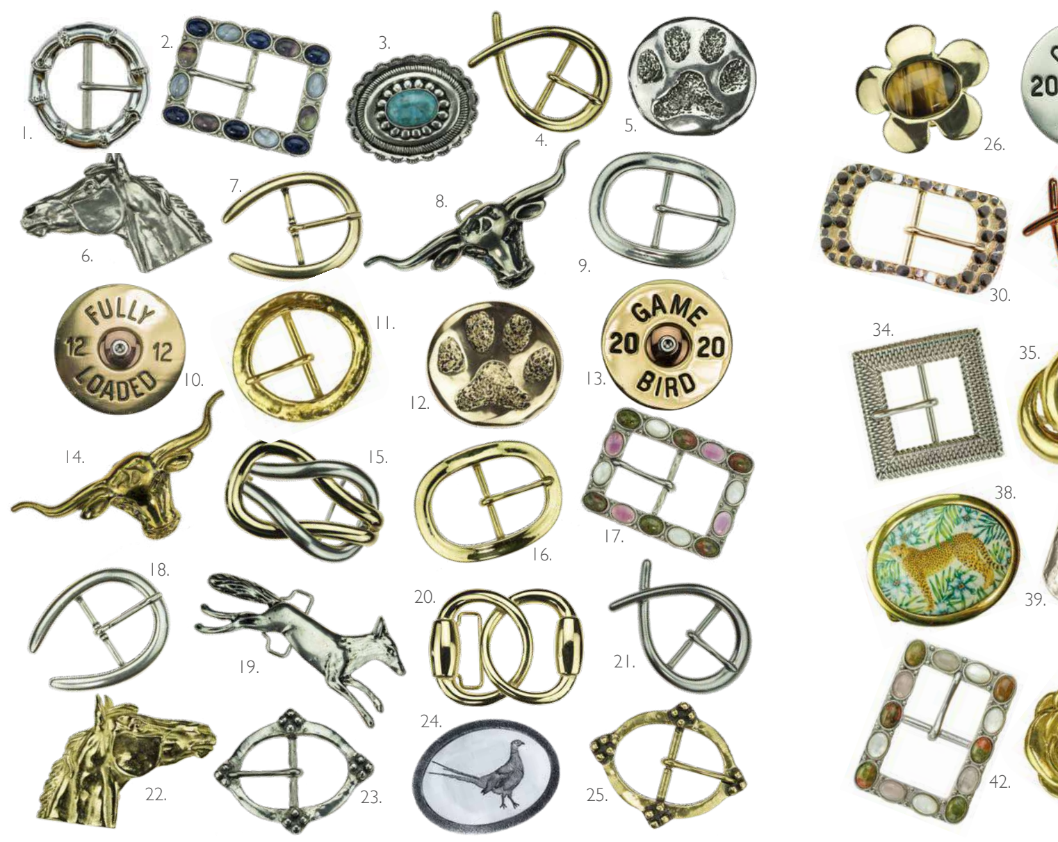
1. Silver Bamboo £45 | 2. Blue Gemstone £65 | 3. Silver Mexican £45 | 4. Gold Twist £35 | 5. Silver Paw £45 6. Silver Thoroughbred £75 | 7. Gold Horseshoe £25 | 8. Silver Steers Head £45 | 9. Chunky Silver Oval £35 10. Gold Fully Loaded £50 | 11. Gold Hoop £35 | 12. Gold Paw £45 | 13. Gold Game Bird £50 | 14. Gold Steershead £45 | 15. Reef Knot £45 | 16. Gold Oval £45 | 17. Pink Gemstone £65 | 18. Silver Horseshoe £25 19. Silver Fox £55 | 20. Gold Bit £50 | 21. Silver Twist £35 | 22. Gold Thoroughbred £75 | 23. Silver Bobble £35 24. Silver Pheasant £50 | Gold Bobble £35