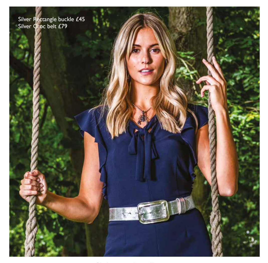
Black, grey and metallic tones