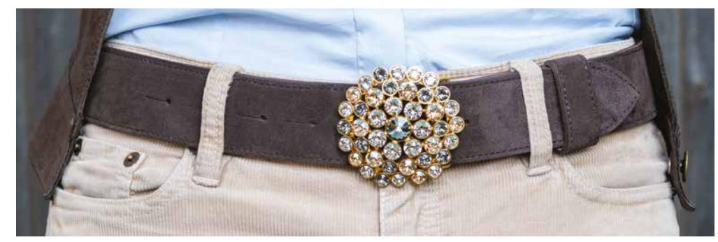
Leopard Waterlily buckle £85 - One belt and 3 different looks