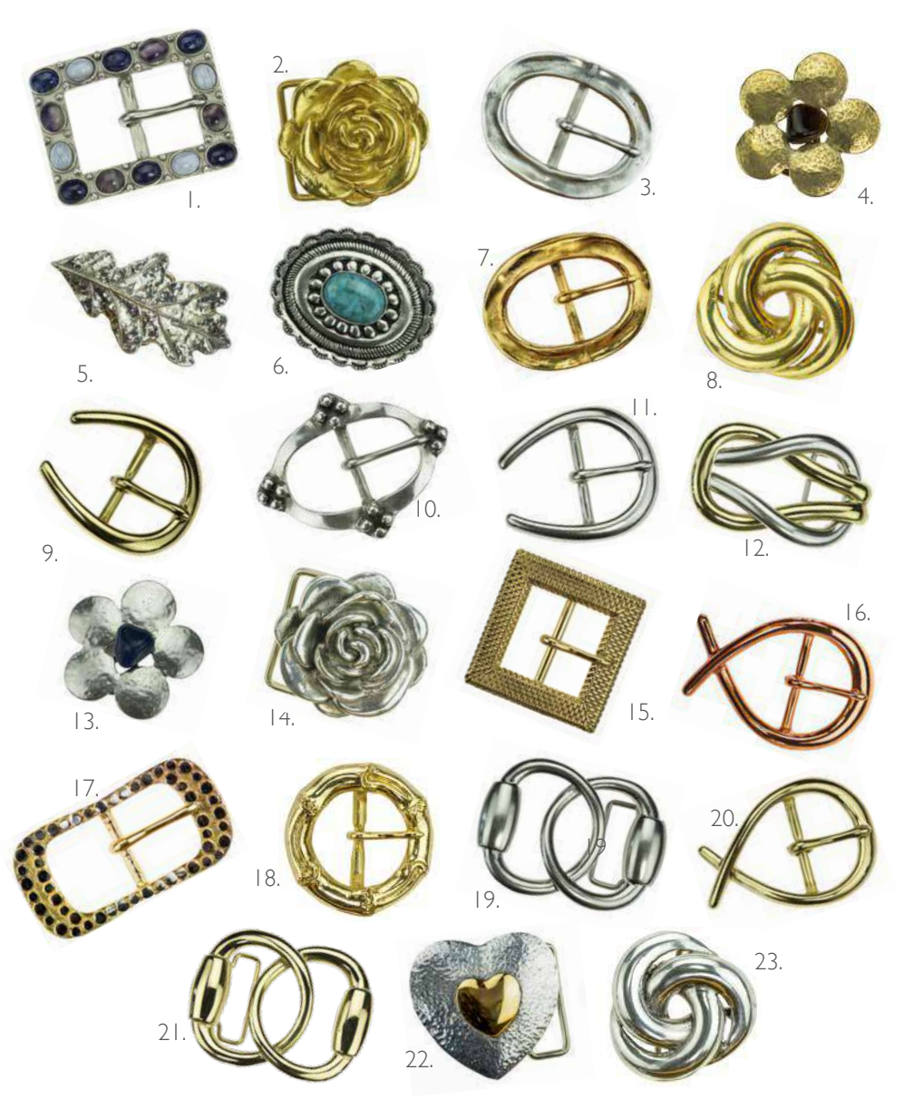
1. Blue Gemstone £60 | 2. Gold Rose £45 | 3. Chunky Silver Oval £25 | 4. Gold Daisy £35 | 5. Silver Oak Leaf £40 6. Silver Mexican £45 | 7. Chunky Gold Oval £25 | 8. Gold Russian Knot £45 | 9. Gold Horseshoe £25 | 10. Silver Bobble £35 | 11. Silver Horseshoe £25 | 12. Reef Knot £40 | 13 Silver Daisy £35 | 14. Silver Rose £40 | 15. Gold Hessian Square £40 | 16. Rose Gold Twist £25 | 17. Studded Rectangle £40 | 18. Gold Bamboo £40 | 19. Silver Bit £50 | 20. Gold Twist £25 | 21. Gold Bit £45 | 22. Two Tone Heart £45 | 23. Silver Russian Knot £45 | 24. Gold Bobble £35 | 25. Silver Bamboo £35 | 26. Gold Oak Leaf £40 | 27. Silver Hessian Square £45 | 28. Gold Gemstone £60 | 29. Silver Twist £25 | 30. Silver Gemstone £60 | 31. Cheetah £75