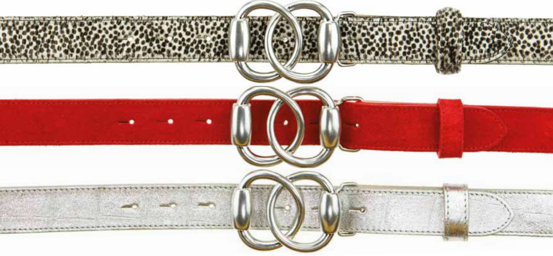
30mm Silver Bit buckle £45 shown on Guinea Fowl £75, Red Suede £70, Silver Croc £75