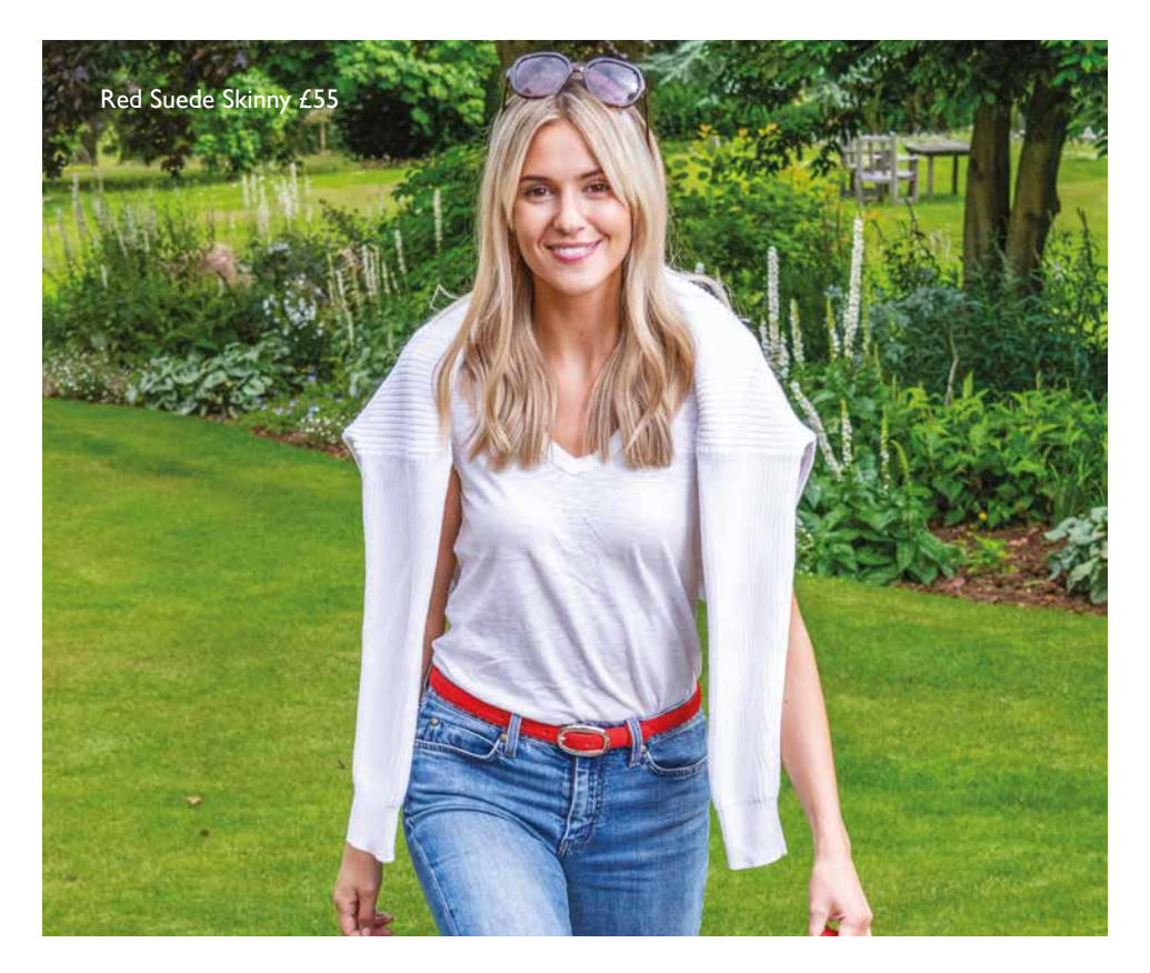
Grey Ostrich, Metallic Python, Navy Croc (gold and silver buckle), Red Suede (gold and silver buckle), Silver Croc, Black Croc (gold and silver buckle), Python and Tan Ostrich all £55. Sizes 28"/70cm — 44"/112cm.