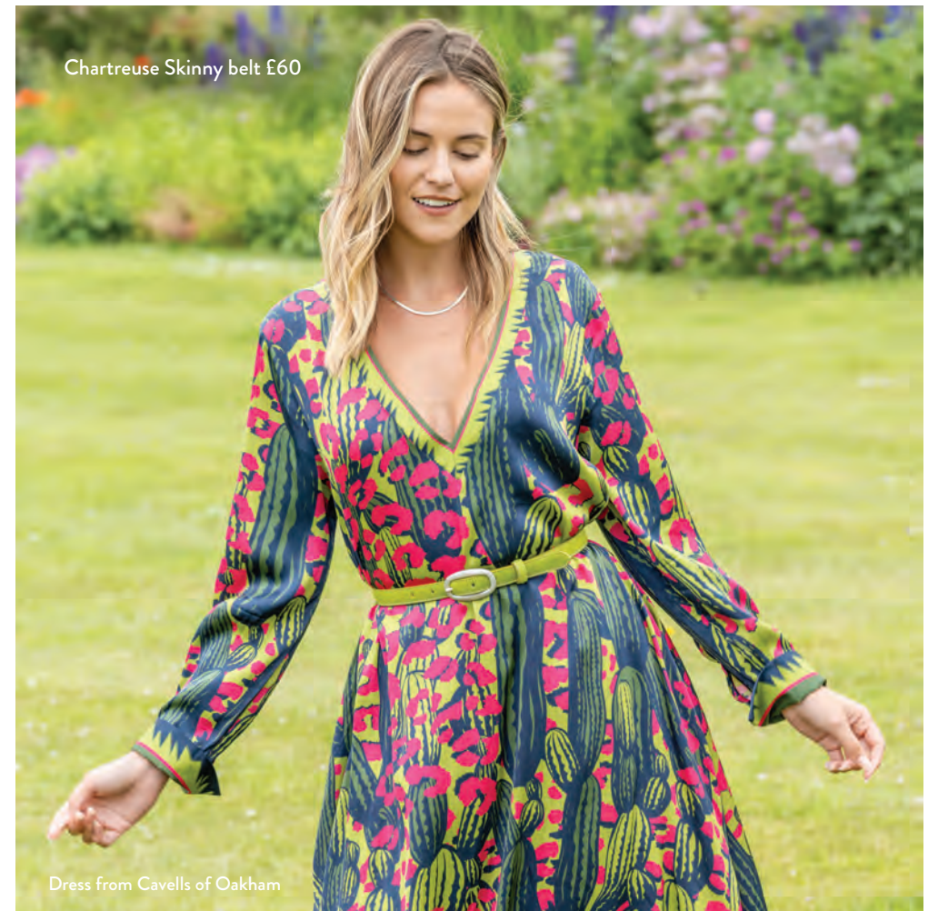
Dress from Cavells of Oakham

Below: pink cowhide, white ostrich (gold or silver buckle), pink python, grey ostrich, silver croc, chartreuse (gold or silver buckle) zebra, navy croc (gold or silver buckle), tan ostrich, python, black croc (gold or silver buckle) £60 | Sizes 28" / 70cm – 44"/112 cm