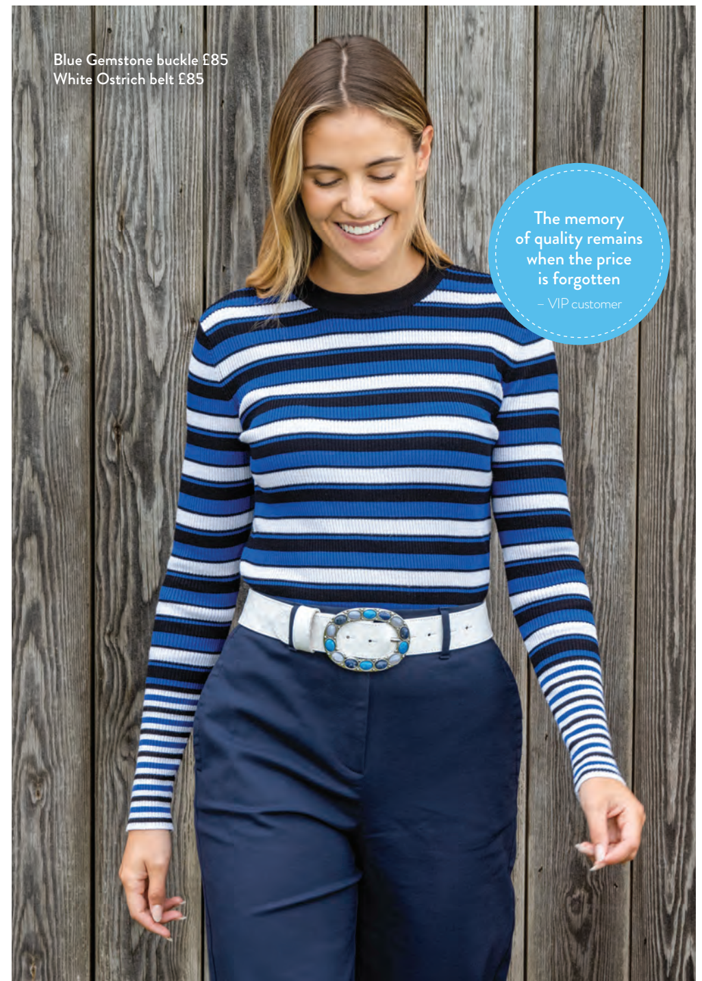
Blue Gemstone buckle £85 White Ostrich belt £85

The memory of quality remains when the price is forgotten – VIP customer