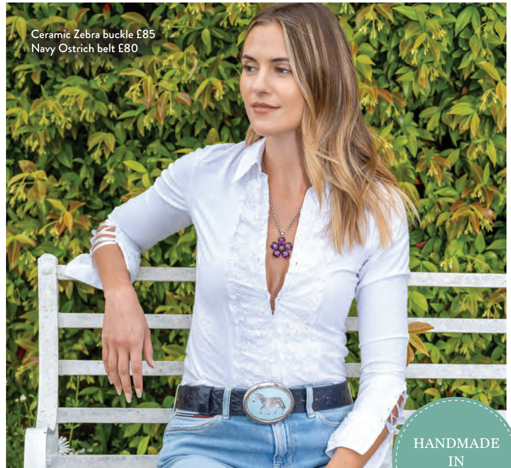
Ceramic Zebra buckle £85 Navy Ostrich belt £80