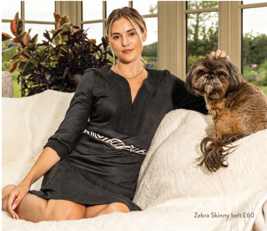
Zebra Skinny belt £60

Below: pink cowhide, white ostrich (gold or silver buckle), pink python, grey ostrich, silver croc, chartreuse (gold or silver buckle) zebra, navy croc (gold or silver buckle), tan ostrich, python, black croc (gold or silver buckle) £60 | Sizes 28" / 70cm – 44"/112 cm