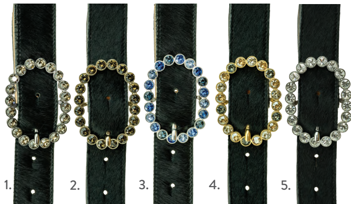
30mm Oval Diamante buckles £55