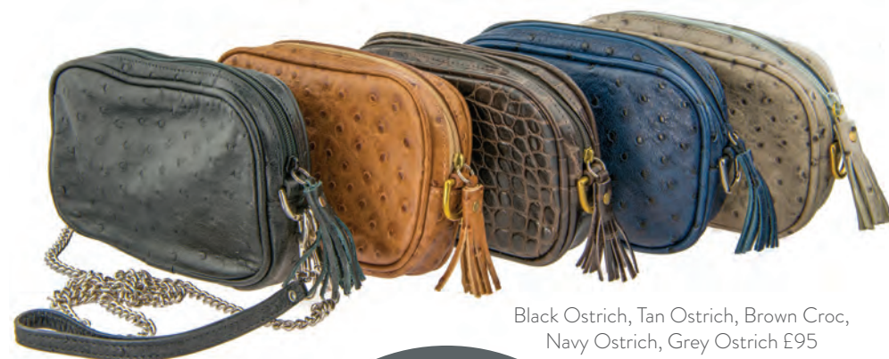
Black Ostrich, Tan Ostrich, Brown Croc, Navy Ostrich, Grey Ostrich £95

A brilliant solution for taking your essentials with you hands-free! This belt bag can be worn three ways - attached to your belt, across your body on the chain shoulder strap, or as a clutch with the simple leather wrist strap. Fully cotton lined with an inside pocket. It measures 18cm x 12cm and costs £120.