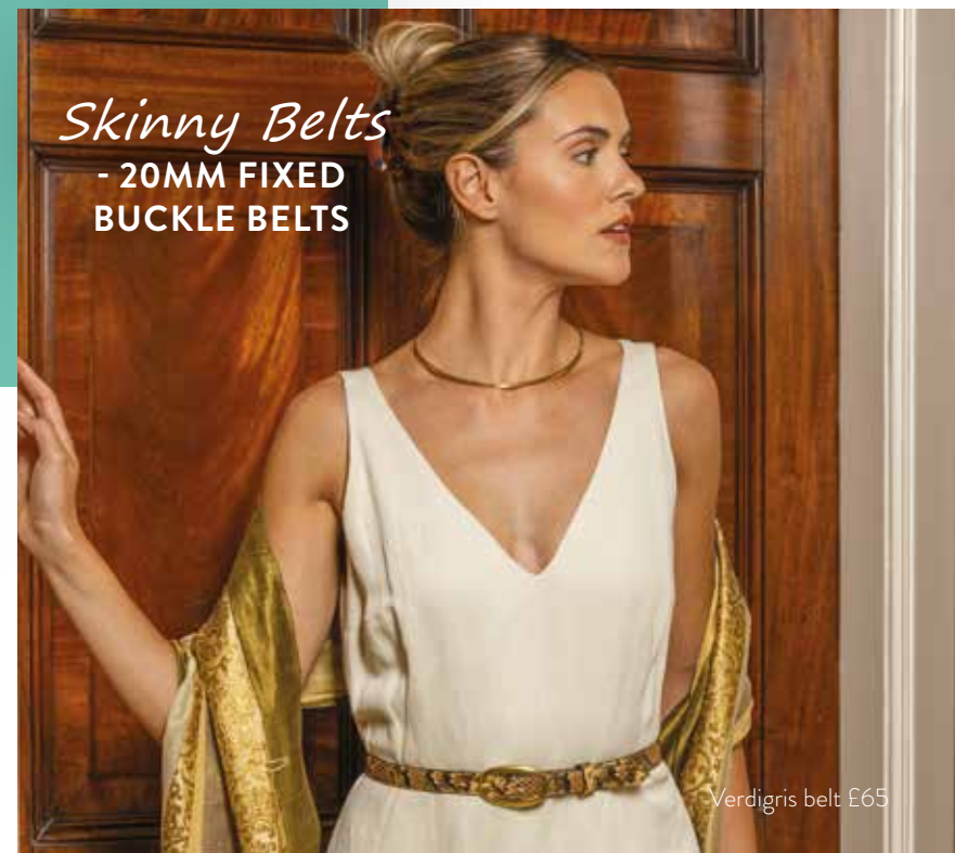
Verdigris belt £65