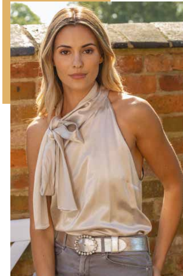
LEFT: White Oval Diamante buckle £60 Silver Croc belt £85