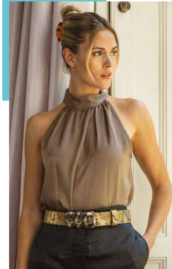
40mm Trio buckle £45 Verdigris belt £89

“Helpful and friendly advice – an accurate description of the product on the website, I received exactly what I expected.” – VIP customer Marina, Switzerland