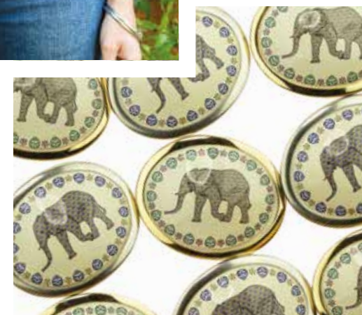
RIGHT: Silver and Gold Elephant buckles