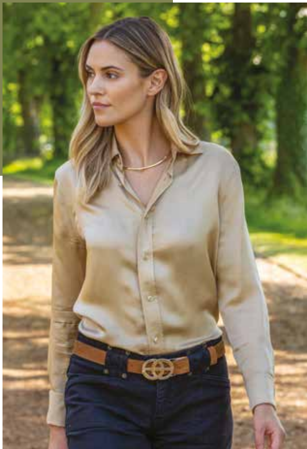
LEFT: 30mm GG buckle £45 30mm Chestnut Suede belt £75