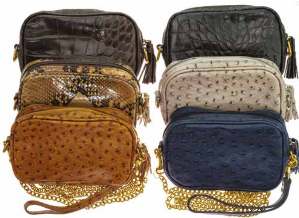
ABOVE, TOP TO BOTTOM:

Brown Croc | Python | Tan Ostrich | Black Croc | Grey Ostrich | Navy Ostrich £120