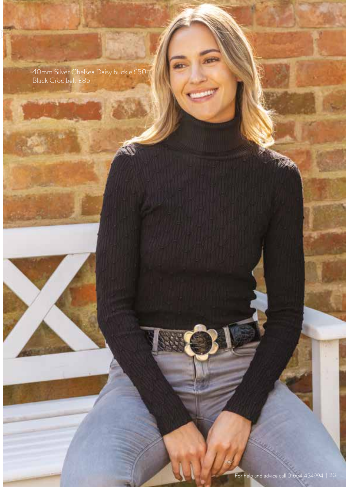
40mm Silver Chelsea Daisy buckle £50 Black Croc belt £85