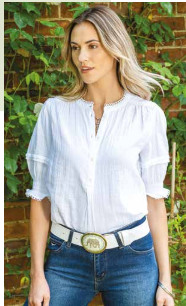
LEFT: Gold Ceramic Elephant buckle £89 White Ostrich belt £85