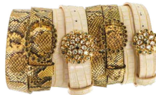
30mm Leopard Waterlily buckle £85 on Pompeii belt £85