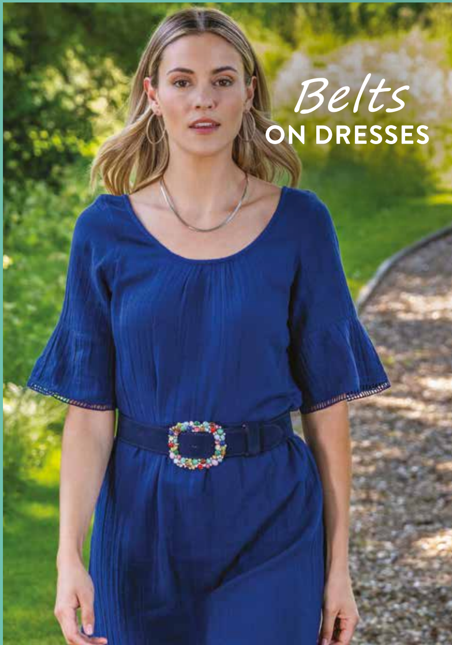
ABOVE: Multicoloured Gemstone buckle £120 | Navy Suede belt £80