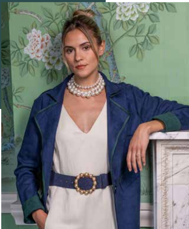
LEFT: Round Detachable Gold Pearl buckle £75 Navy Stretch belt £75

Round Detachable, Silver Pearl buckle £75 | Black Stretch belt with Plain buckle £75 Topaz Diamante buckle £75 | Biscuit Stretch belt with Plain Gold buckle £75 White Diamante buckle £75 | Navy Stretch belt with Plain Casein buckle £75