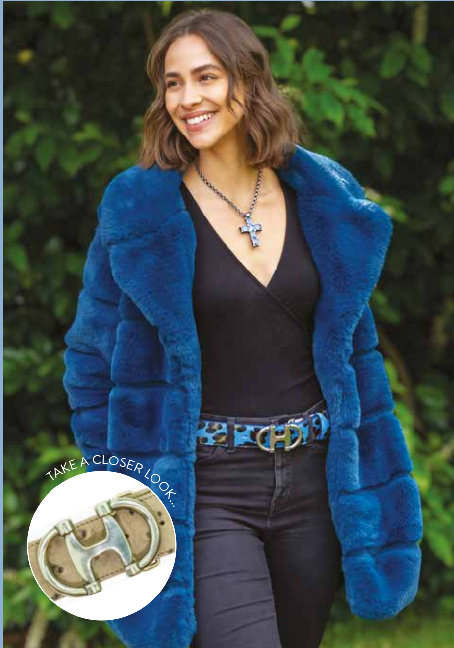
ABOVE: Silver Double D buckle £50 on Blue Leopard belt £86