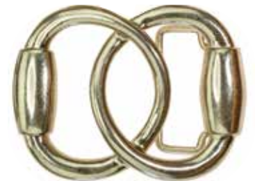
Silver Bit buckle £55