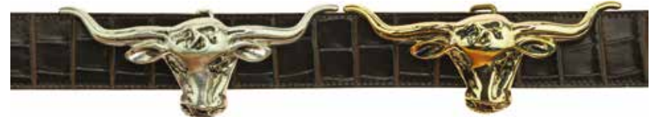
Steers Head £55