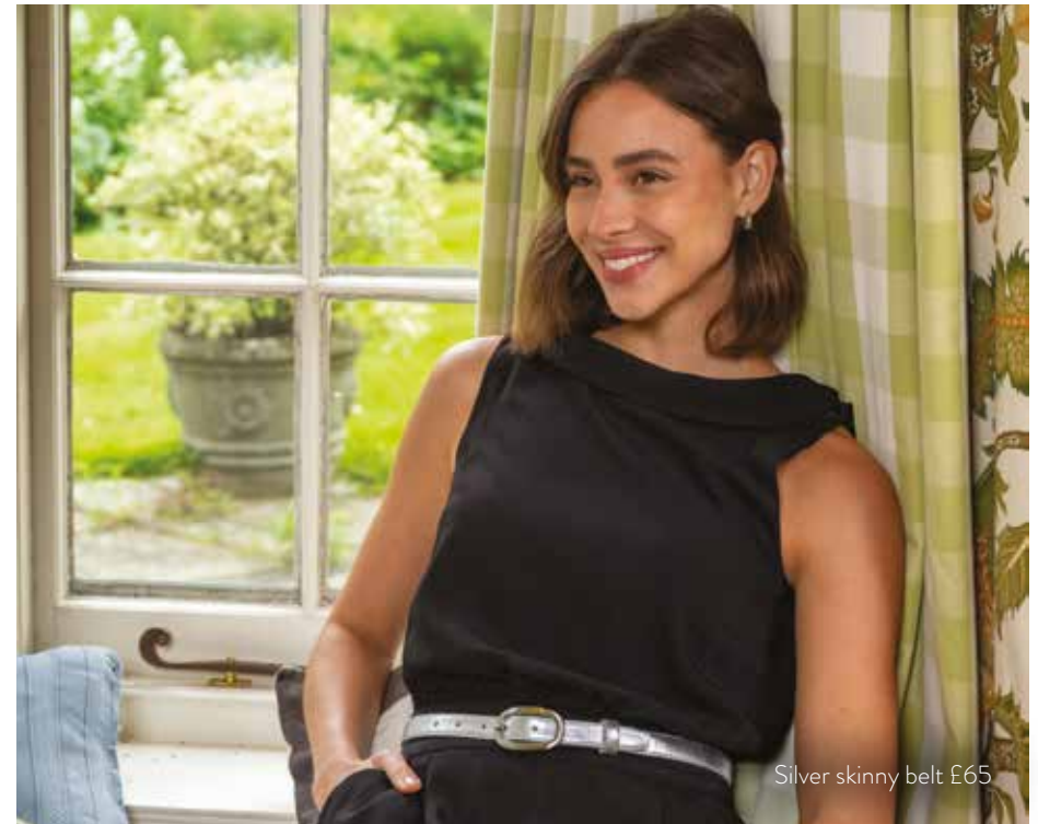
Silver skinny belt £65