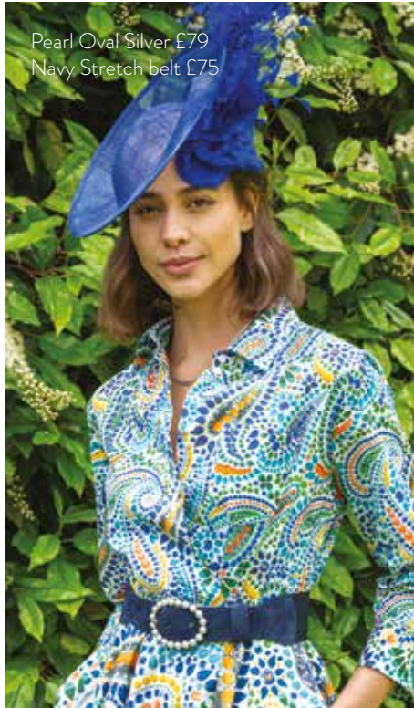
Pearl Oval Silver £79 Navy Stretch belt £75