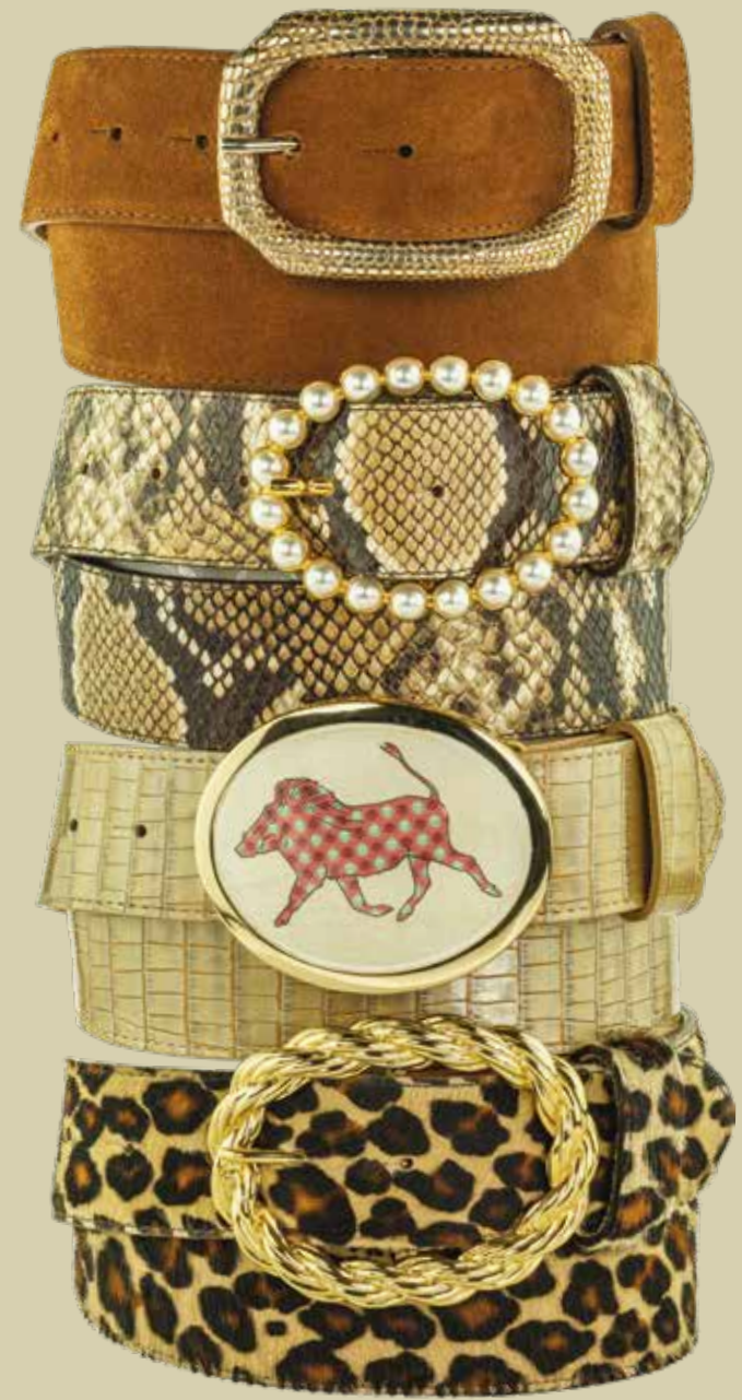
Cobbles buckle £35 on Chestnut suede belt £80 Gold Pearl Oval buckle £75 on Brown Python belt £86 Gold Warthog buckle £89 on Sand Patent Croc belt £86 Gold Rope buckle £50 on Leopard belt £86