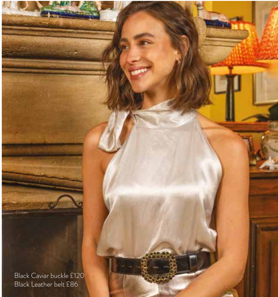
Black Caviar buckle £120 Black Leather belt £86