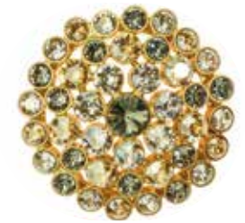
Leopard Waterlily £115