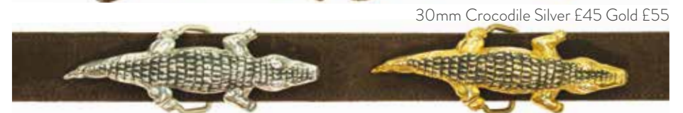
30mm Crocodile Silver £45 Gold £55