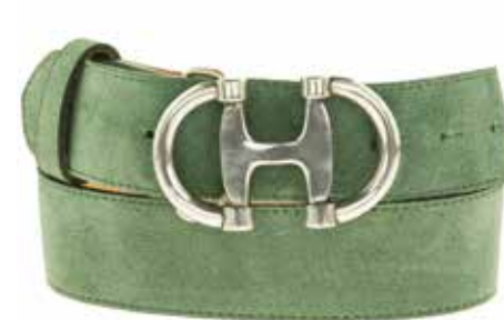
Silver Double D £50 on Green Suede £80