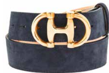
Gold Double D £55 on Navy Suede £80