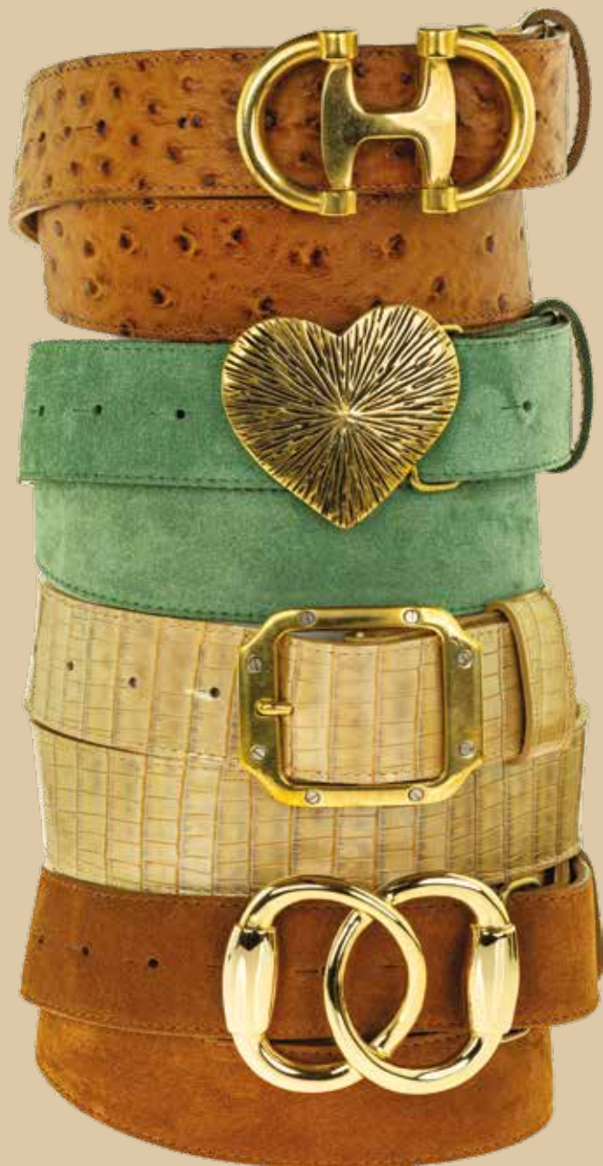
Gold Double D buckle £55 on Tan Ostrich belt £86 Gold Exploding Heart buckle £55 on Green Suede belt £80 Gold Santorini buckle £65 on Sand Patent Croc belt £86 Gold Bit buckle £55 on Chestnut Suede belt £80