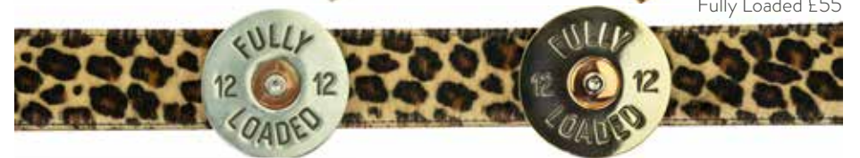
Fully Loaded £55