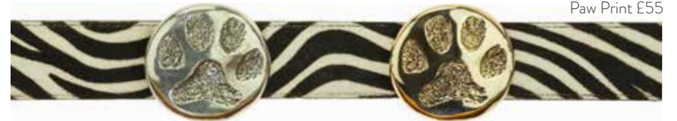
Paw Print £55