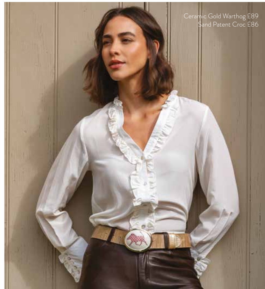
Ceramic Gold Warthog £89 Sand Patent Croc £86