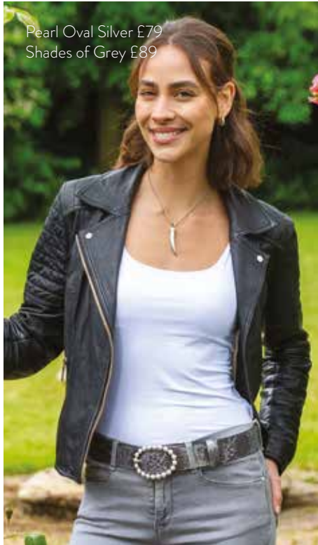
Pearl Oval Silver £79 Shades of Grey £89