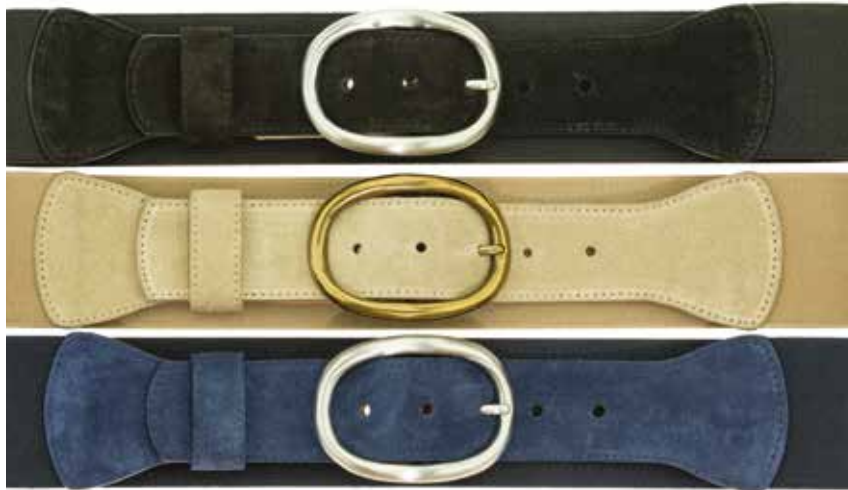
Stretch belts with Gold or Silver Orb buckles in Navy, Mushroom & Black - £75 NEW colours being added soon!