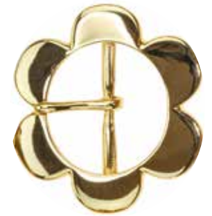
Gold Chelsea Daisy £50