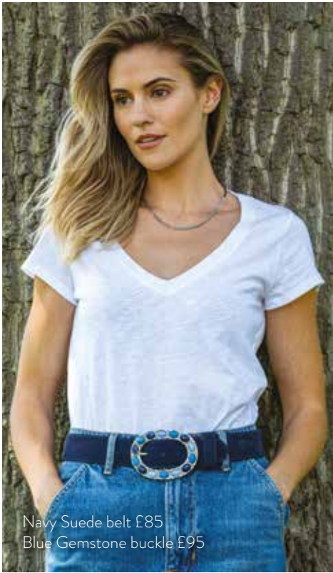
Navy Suede belt £85 Blue Gemstone buckle £95