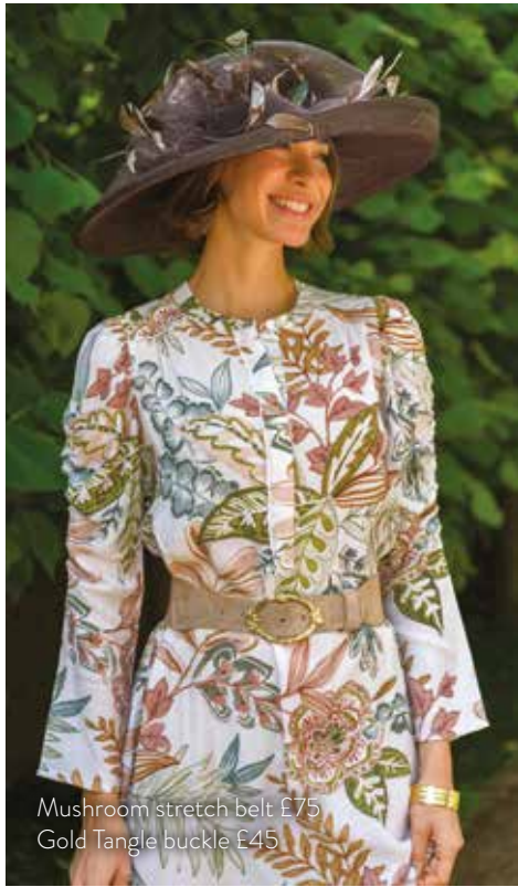
Mushroom stretch belt £75 Gold Tangle buckle £45