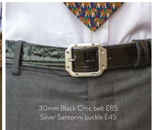
30mm Black Croc belt £85 Silver Santorini buckle £45