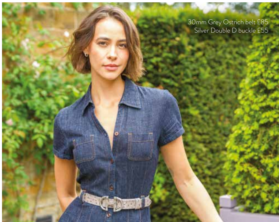
30mm Grey Ostrich belt £85 Silver Double D buckle £55