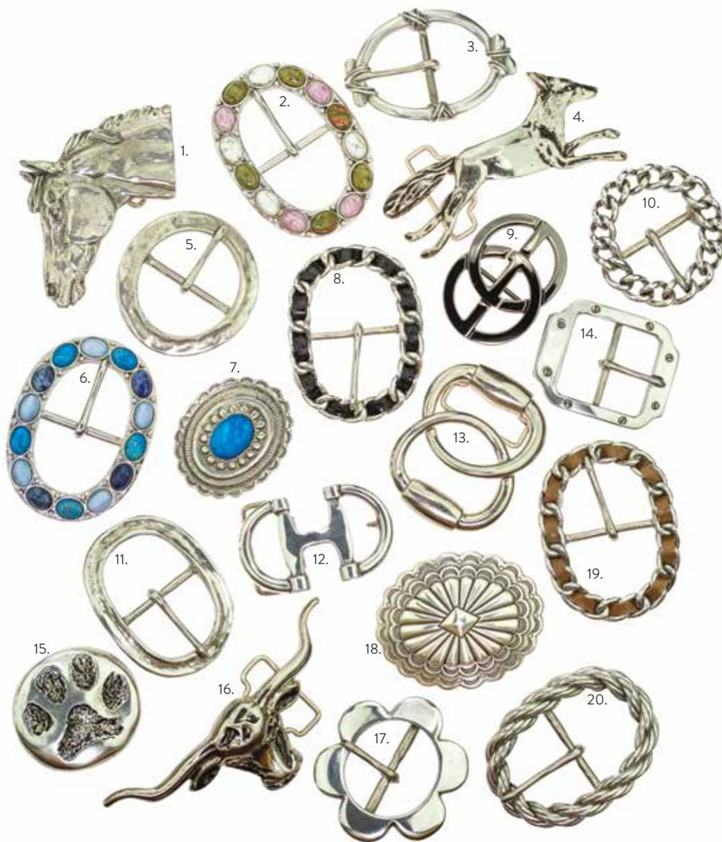
1. Thoroughbred £75 | 2. Pink Gemstone £89 | 3. Tangle £45 | 4. Fox £60 | 5. Hoop £50 | 6. Blue Gemstone £89 | 7. Turquoise Mexican £60 | 8. Coco Silver Black £75 | 9. Black Double D £45 | 10. Chain £50 | 11. Oval £50 | 12. Double D £55 | 13. Bit Buckle £60 | 14. Santorini £65 | 15. Paw £55 | 16. Steers Head £55 | 17. Daisy £60 | 18. Sunrise £55 | 19. Coco Silver Mink £75 | 20. Rope £55

Buckles easily snap onto any belt colour