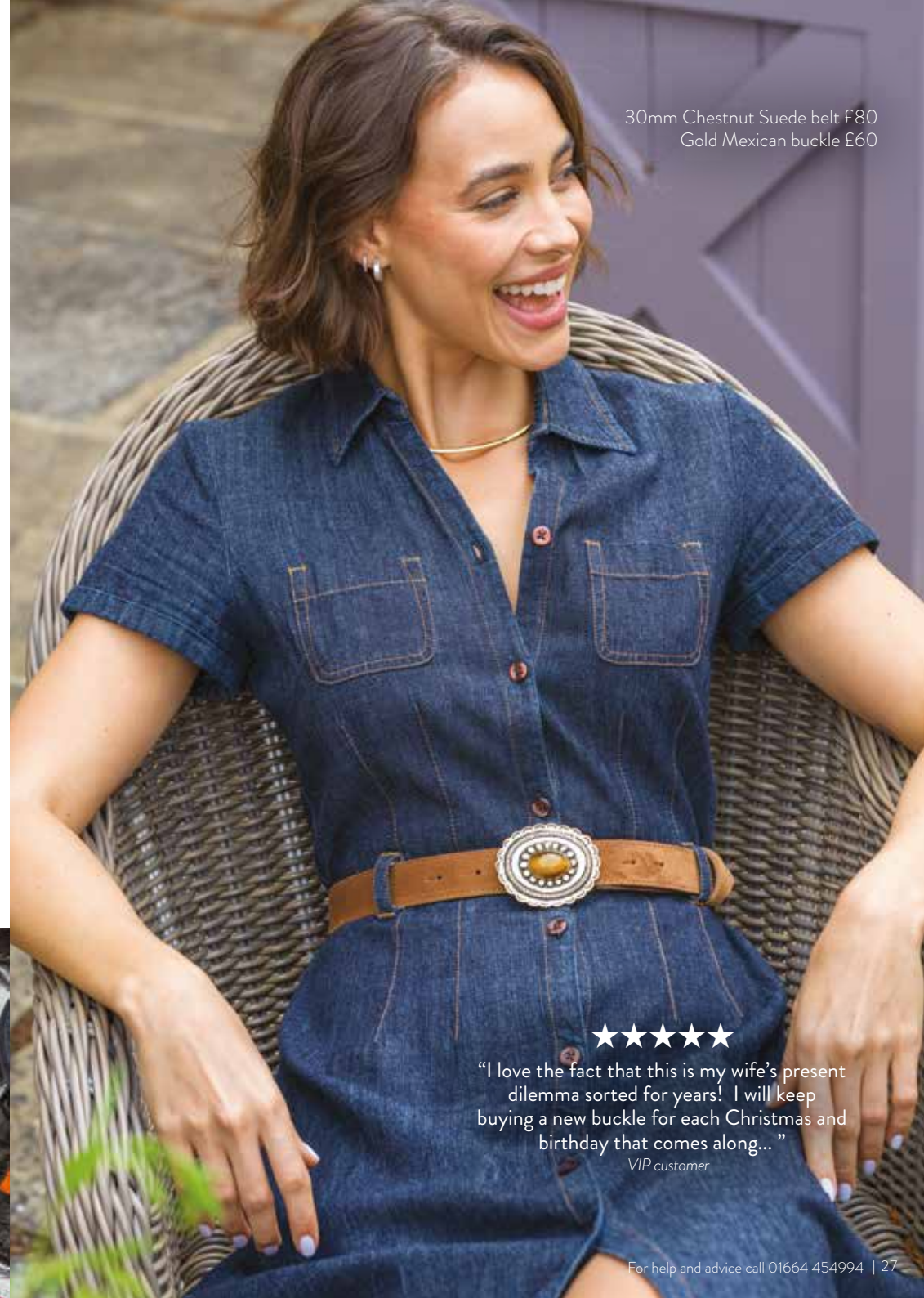
30mm Chestnut Suede belt £80 Gold Mexican buckle £60