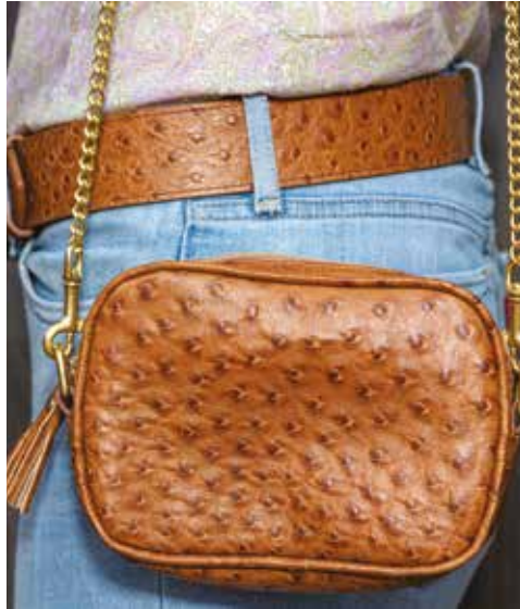
Black Croc, Navy, Tan and Grey Ostrich with a shoulder strap / wrist strap / belt loops £135