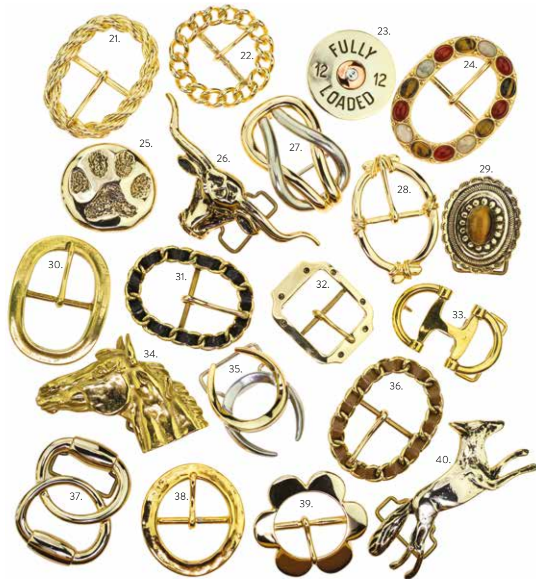
21. Rope £55 | 22. Chain £50 | 23. Cartridge £55 | 24. Gold Gemstone £89 | 25. Paw £55 | 26. Steers Head £55 | 27. Reef Knot £60 | 28. Tangle £45 | 29. Tigers Eye Mexican £60 | 30. Oval £50 | 31. Coco Gold Black £80 | 32. Santorini £65 | 33. Double D £60 | 34. Thoroughbred £75 | 35. Double C £65 | 36. Coco Gold Mink £80 | 37. Bit £60 | 38. Hoop £50 | 39. Daisy £60 | 40. Fox £60

Buckles easily snap onto any belt colour