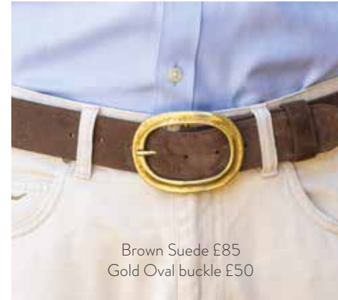
Brown Suede £85 Gold Oval buckle £50

Generally men buy one size up from their jean size - we carry up to 46" in stock