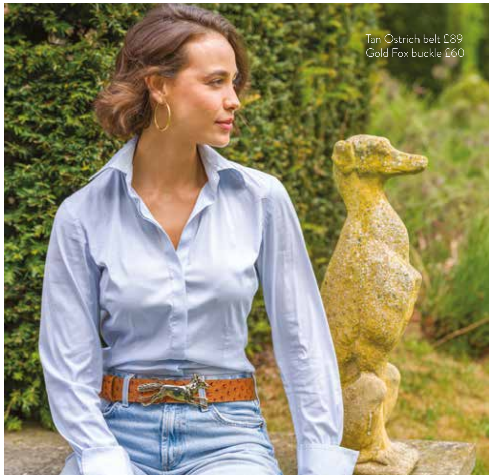
Tan Ostrich belt £89 Gold Fox buckle £60