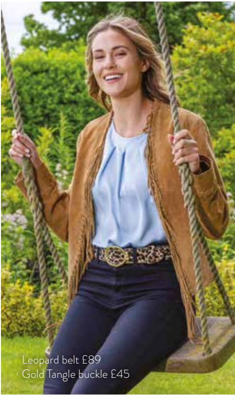
Leopard belt £89 Gold Tangle buckle £45