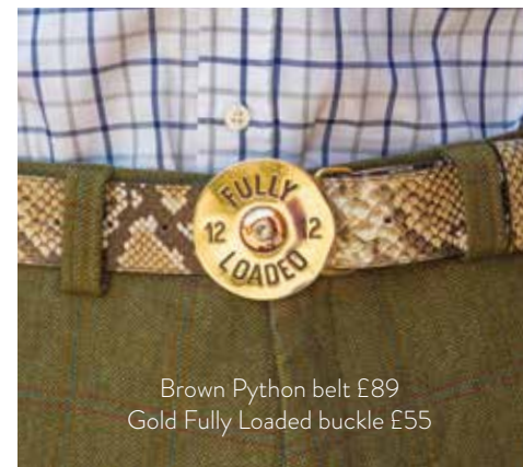
Brown Python belt £89 Gold Fully Loaded buckle £55