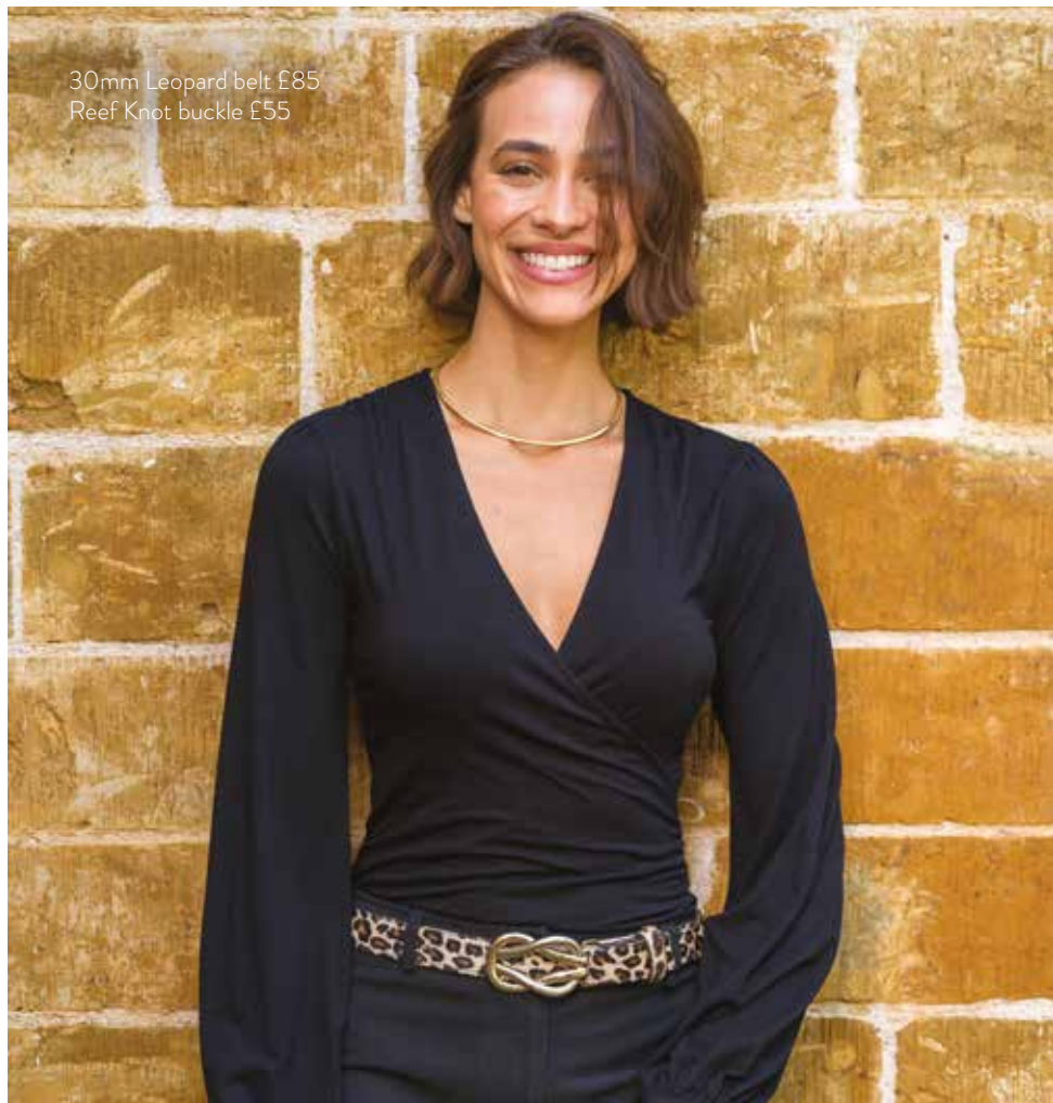
30mm Leopard belt £85 Reef Knot buckle £55