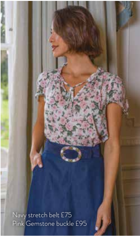
Navy stretch belt £75 Pink Gemstone buckle £95