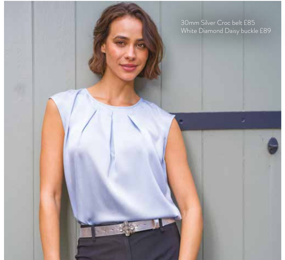
30mm Silver Croc belt £85 White Diamond Daisy buckle £89