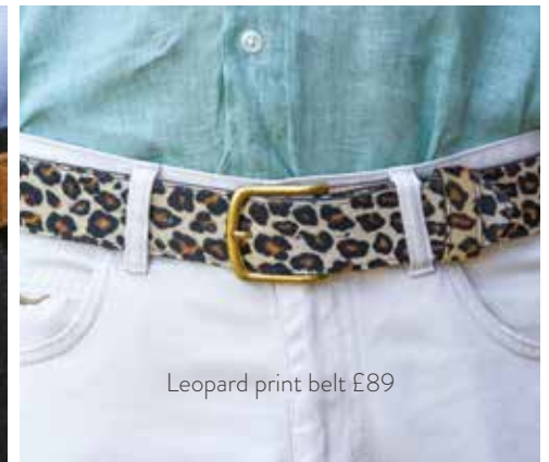
Leopard print belt £89