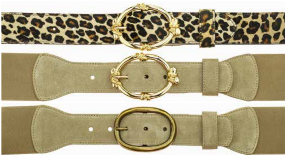
Stretch belts come with a silver or gold plain buckle £75