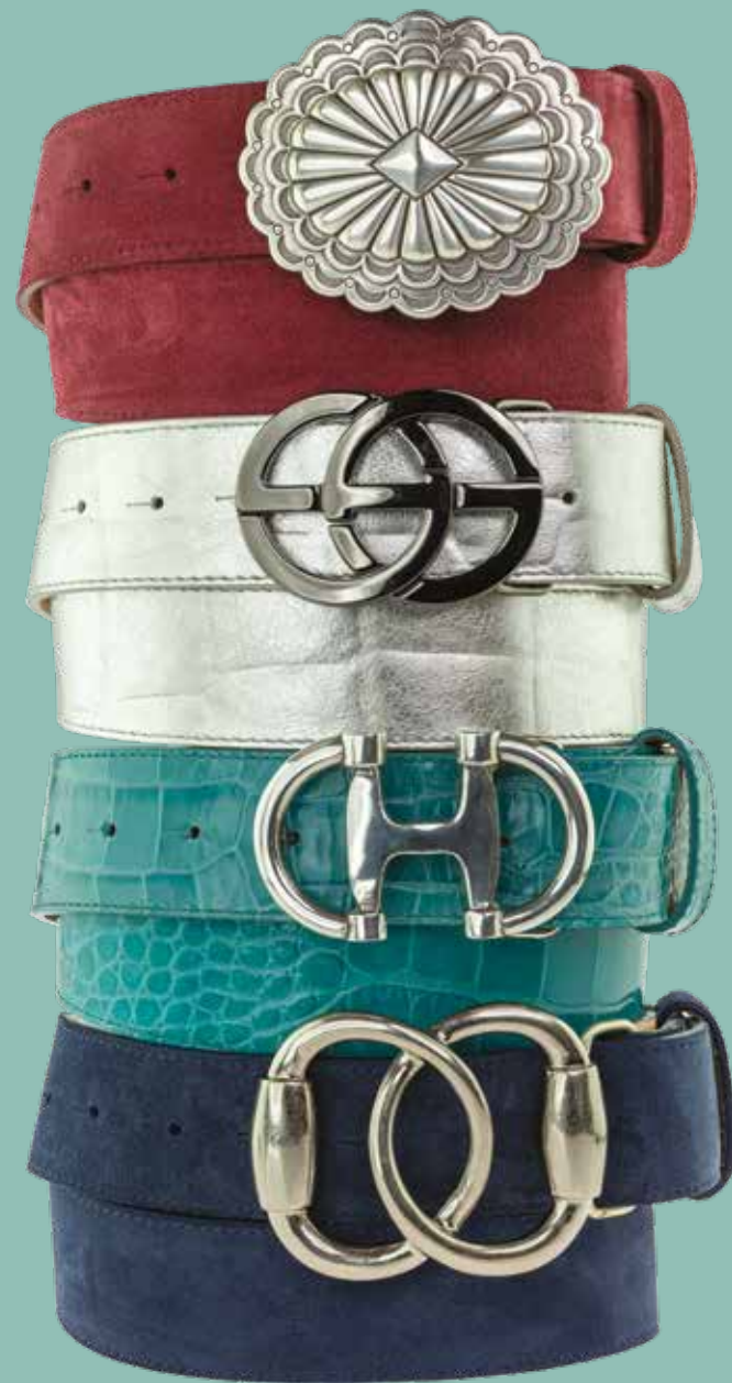
Claret Suede belt £85 Sunrise buckle £55 Silver Croc belt £89 Black Double D buckle £45 Barbados belt £89 Silver Double D buckle £55 Navy Suede belt £85 Silver Bit buckle £60