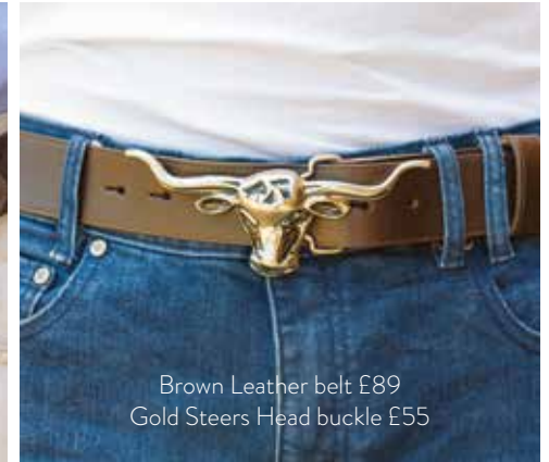
Brown Leather belt £89 Gold Steers Head buckle £55