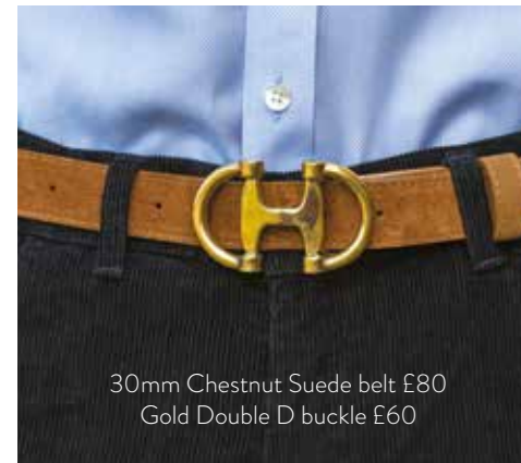
30mm Chestnut Suede belt £80 Gold Double D buckle £60