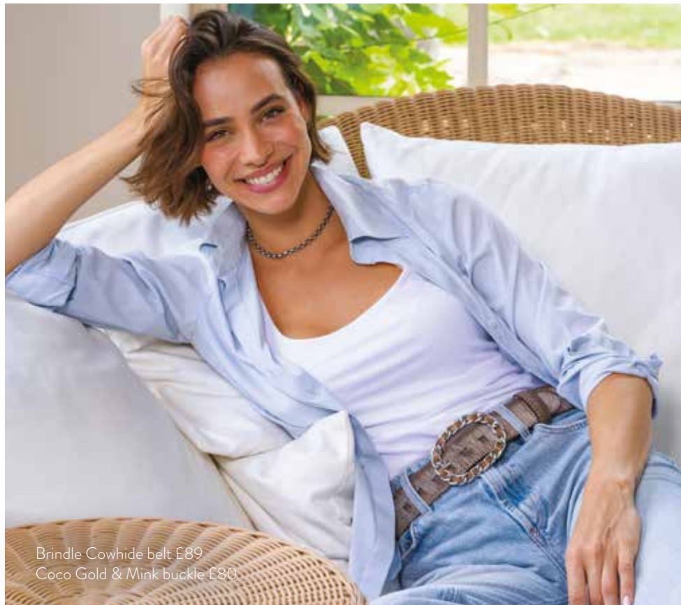
Brindle Cowhide belt £89 Coco Gold & Mink buckle £80