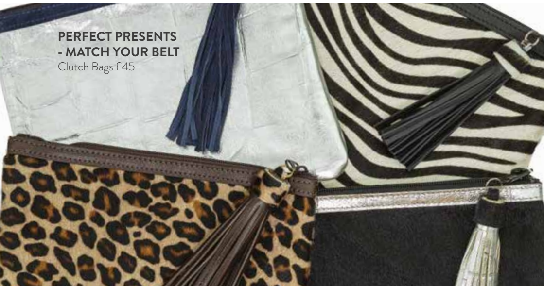
PERFECT PRESENTS - MATCH YOUR BELT Clutch Bags £45